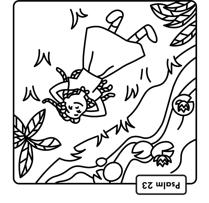
1. This song is from the book of Psalms in the Bible: God is my leader and protector; I don't need anything when I have God. You lead me to peaceful, green fields and still waters. You bring rest to my soul.