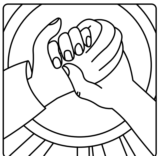
4. Surely, I will know goodness and forgiveness every day of my life, and I will be near to you, God, always.